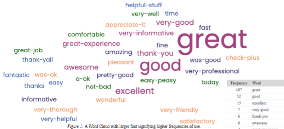
Figure 1: A Word Cloud with larger font signifying higher frequencies of use.

This feedback was provided by SAFD firefighters who participated in the Inaugural Wellness Fair